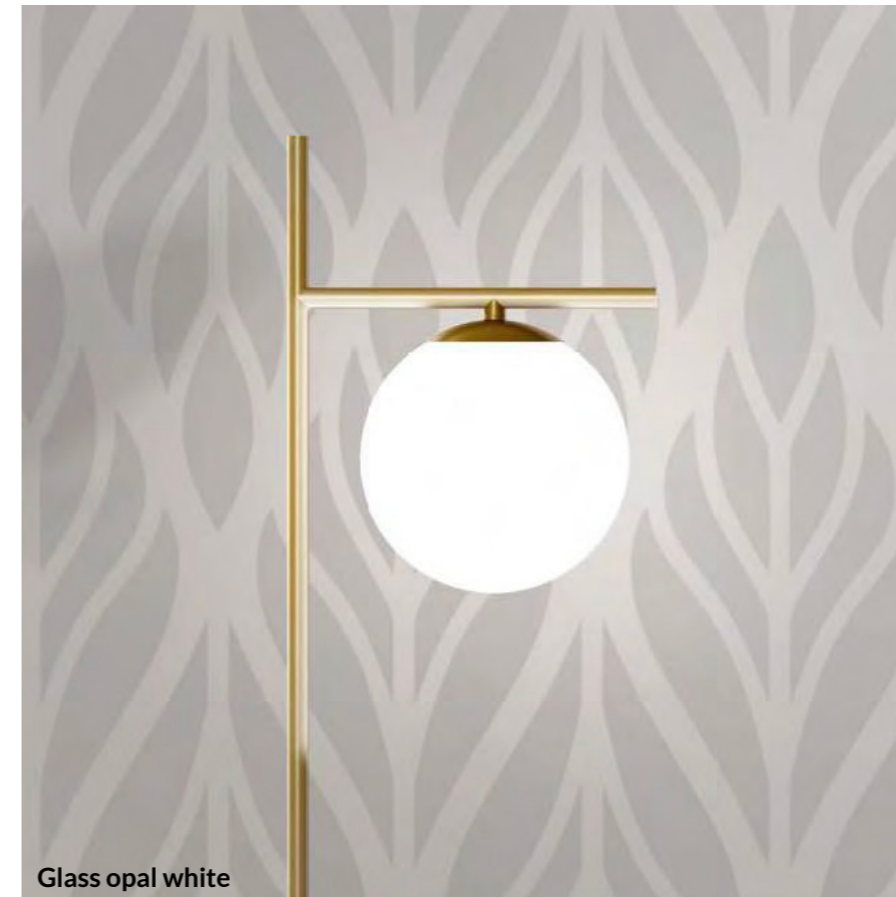
Glass opal white

Coordinated series consisting of wall lamps, table lamp, floor lamp and Suspension. Metal frame finish brass. Glass sphere opal white